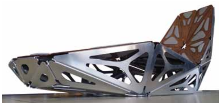
Launch chair by Kas Oosterhuis, Dutch Creative Industries, presented by VAA.ONL

At the forefront of the global design trend, Dutch design will be taking