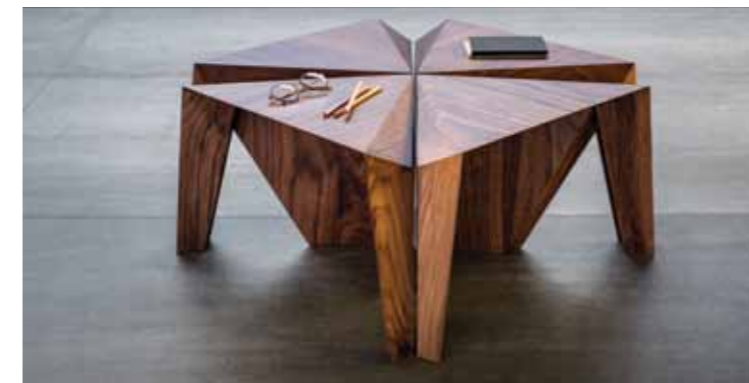
Square One, Tarek EL Kassouf, Squad Design