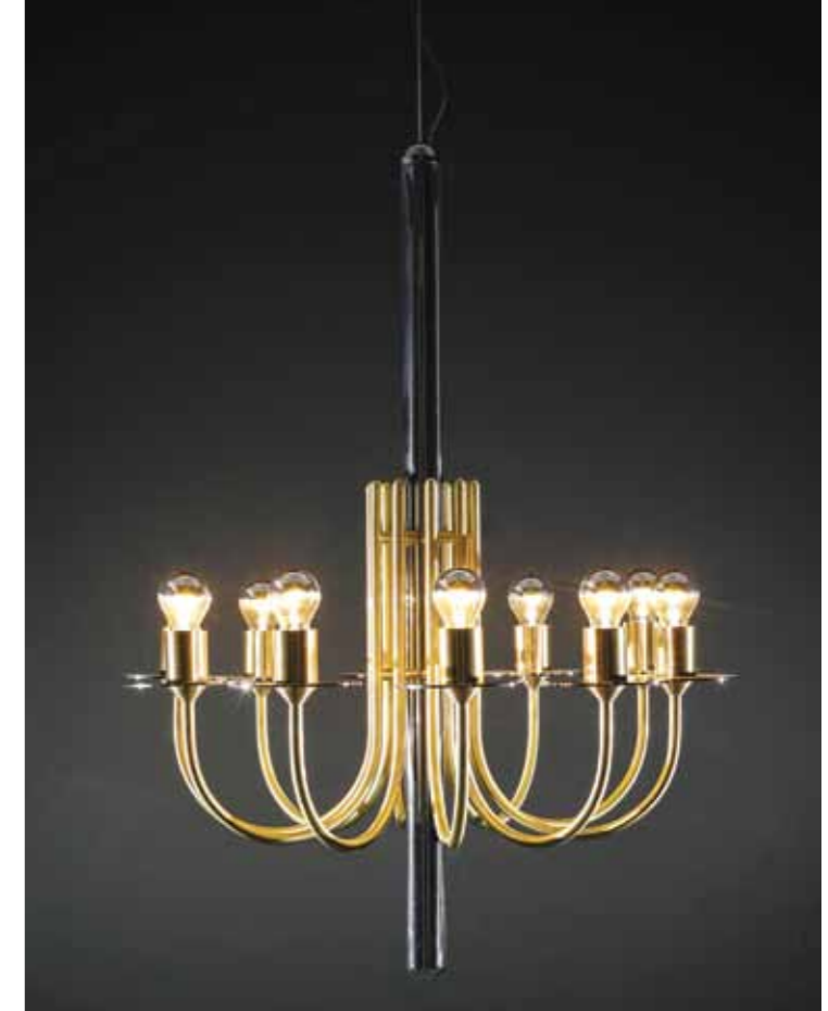
David & Nicolas chandelier, Art Factum Gallery