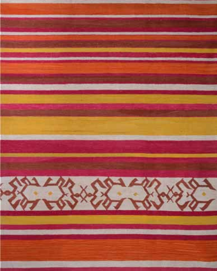
Carpets of Love collection, Samovar (Kuwait), Abdulla Al Awadi