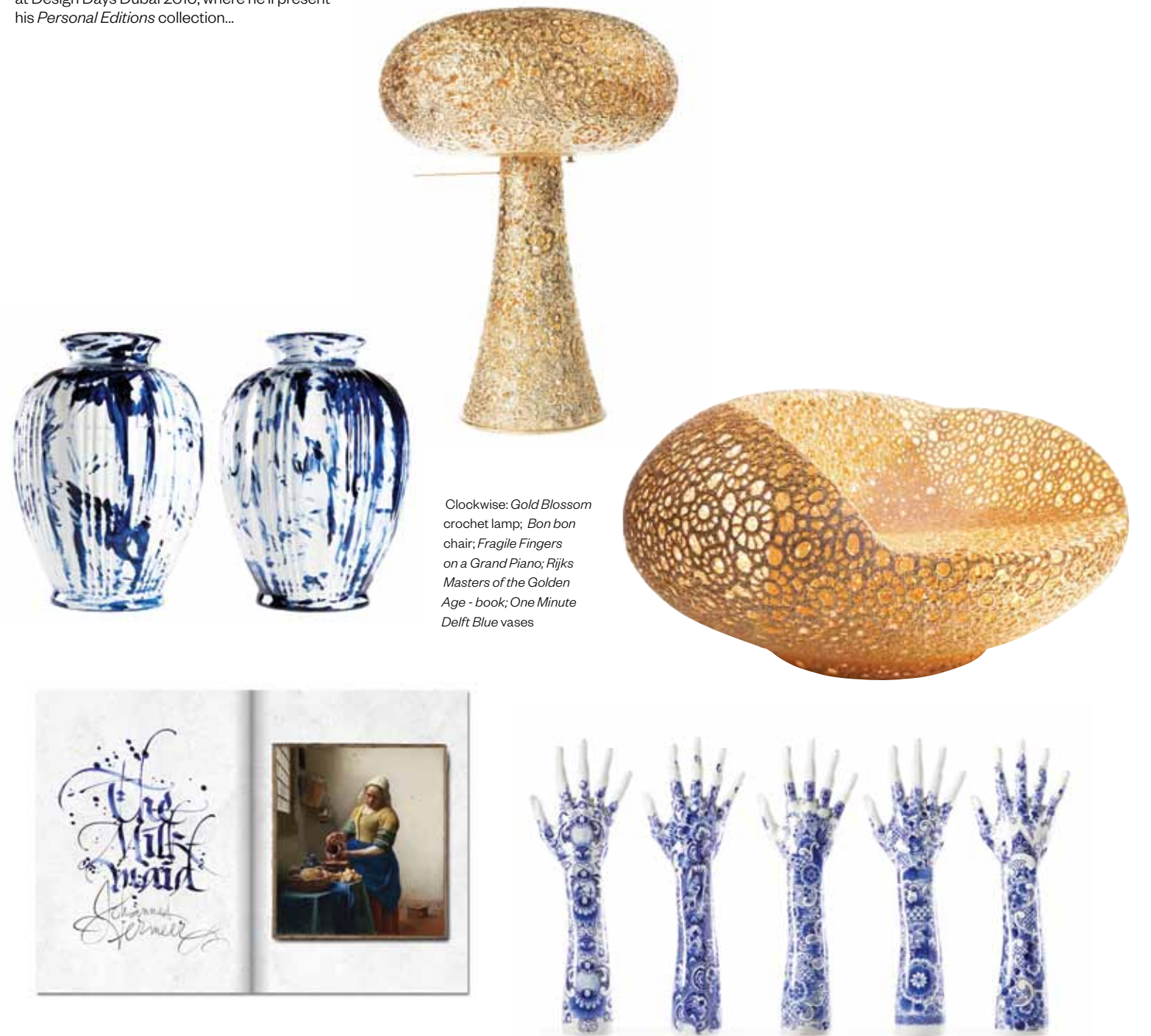
Clockwise: Gold Blossom crochet lamp; Bon bon chair; Fragile Fingers on a Grand Piano; Rijks Masters of the Golden Age - book; One Minute Delft Blue vases