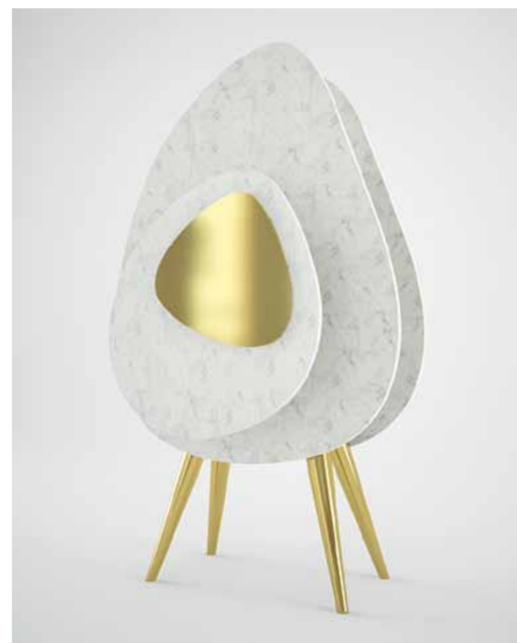
The Hidden bookshelves, Carrara marble and brass, by Loulwa Al-Radwan