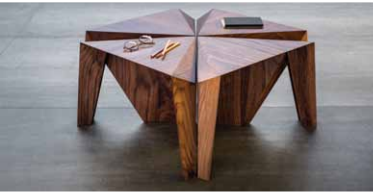
Square One, Tarek EL Kassouf, Squad Design