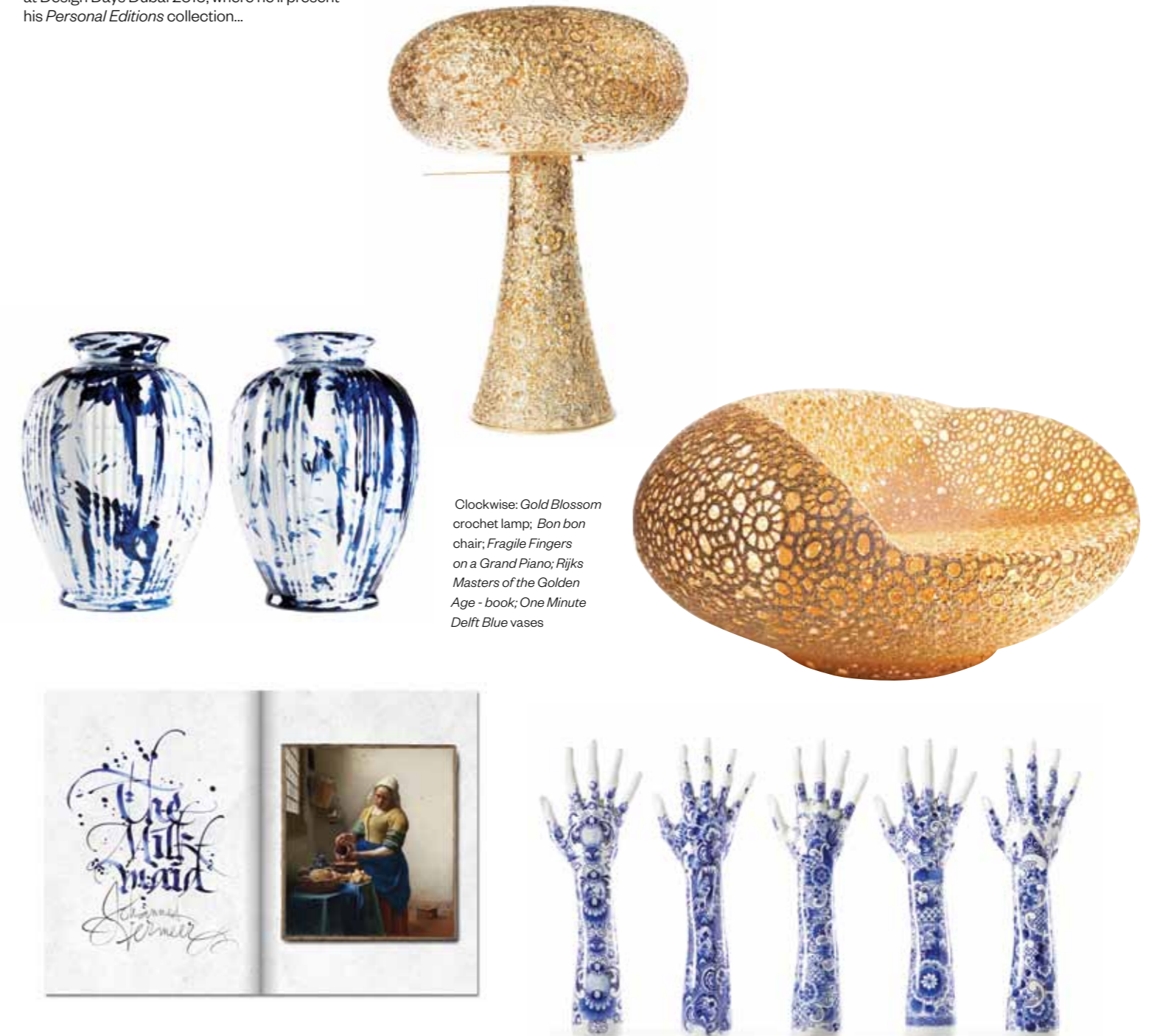
Clockwise: Gold Blossom crochet lamp; Bon bon chair; Fragile Fingers on a Grand Piano; Rijks Masters of the Golden Age - book; One Minute Delft Blue vases