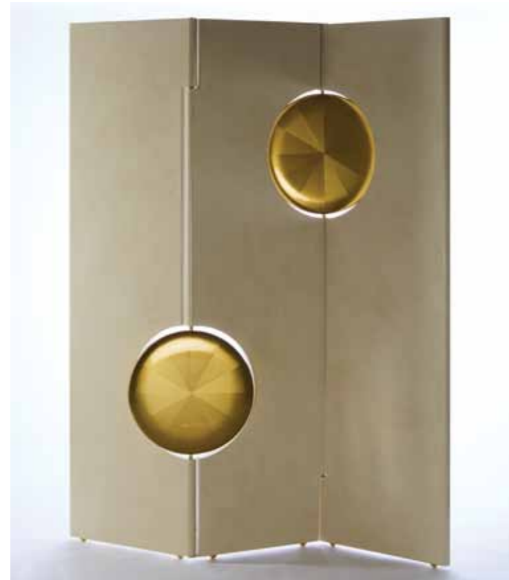
Cosmos decorative screen by Aurelia, JCT Gallery