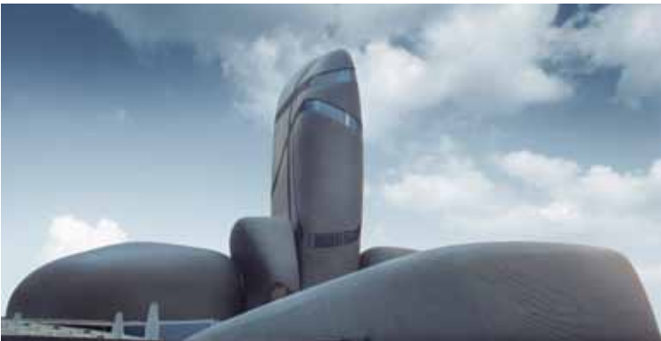
King Abdulaziz Center for World Culture