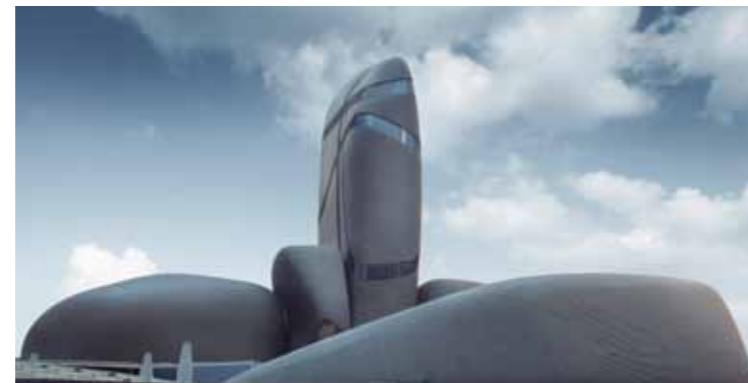
King Abdulaziz Center for World Culture