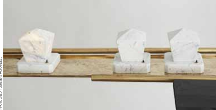
Marble lamp by Veronica Todisco, Camp Design Gallery Adaptations