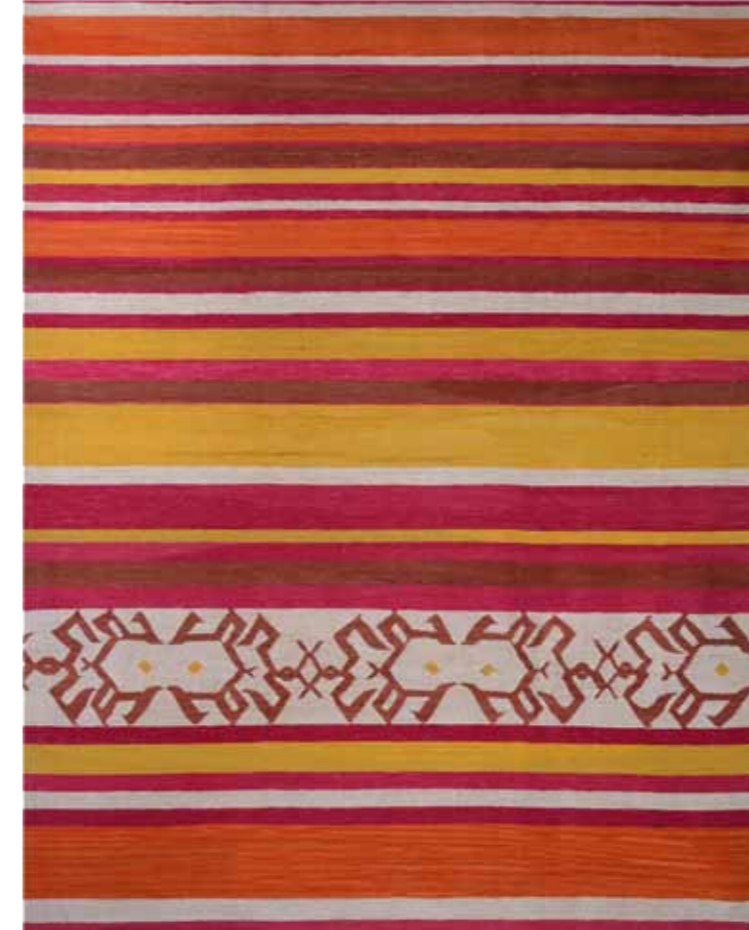
Carpets of Love collection, Samovar (Kuwait), Abdulla Al Awadi