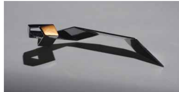
Monogram, Sculptural Collection, 'Waw' Escaping Flatland