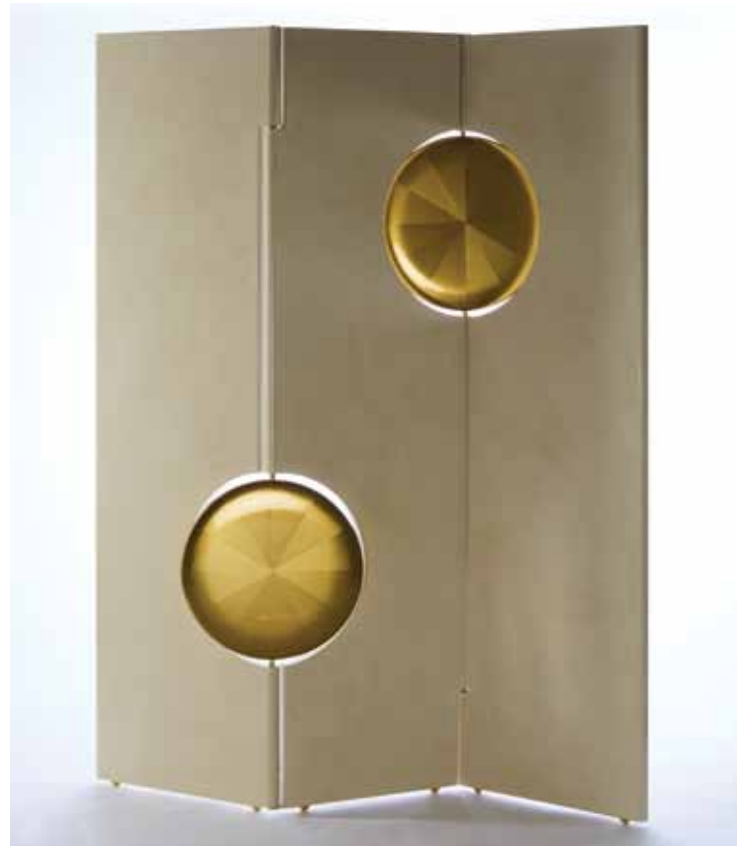
Cosmos decorative screen by Aurelia, JCT Gallery