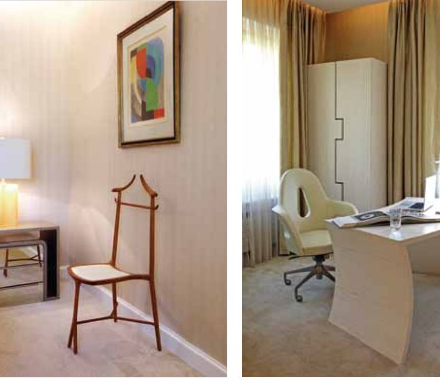
I design it and we have it produced by talented craftsmen."